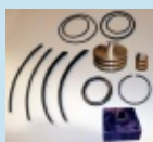
Spare set of o-rings and segments