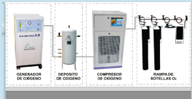
Schematic example For an oxygen cylinder filling plants